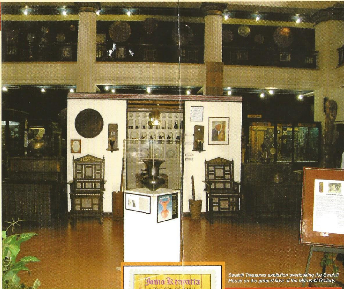
Swahili Treasures exhibition overlooking the Swahili House on the ground floor of the Murumbi Gallery.