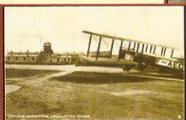
Croydon Aerodrome, near London, early 1930's, the starting place for all flights from London to East Africa